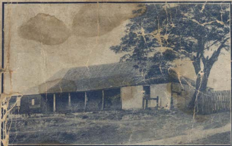
OLD GOVERNMENT HOUSE, WINDSOR.

Built between 1796-98. Still standing 1915.